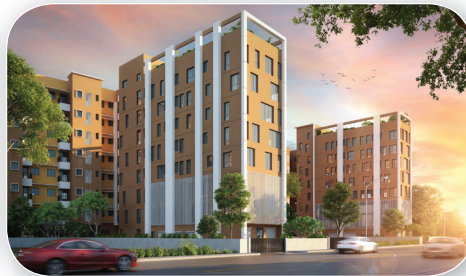
The Commercial Towers