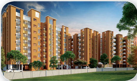
The Residential Towers