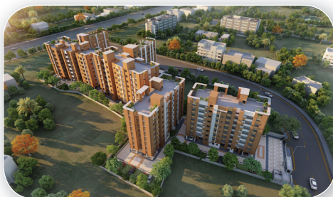
Virtual Bird's eye view